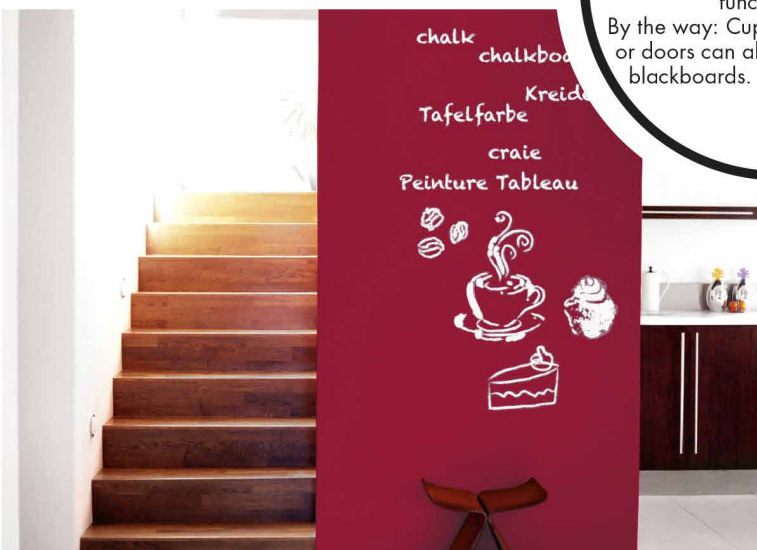
Painted with Tafel Bordeaux 129