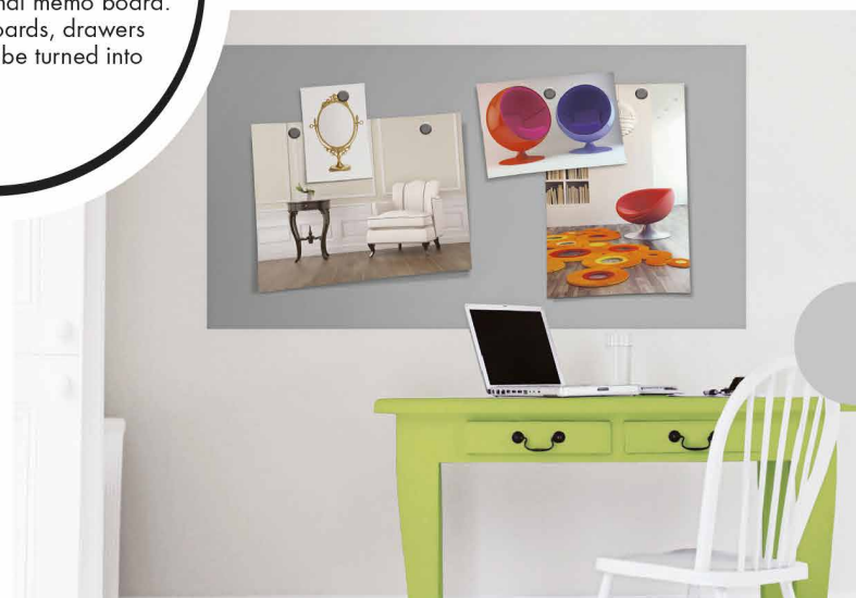
Painted with Magnet 815